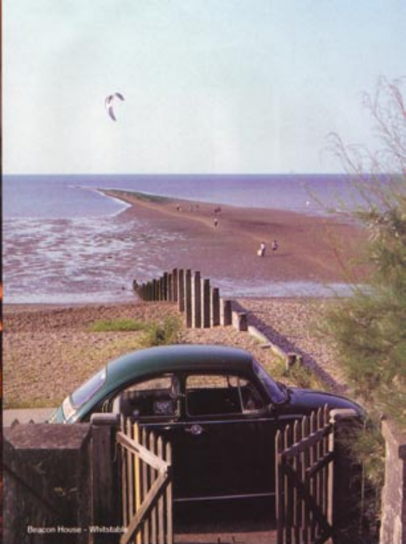
Beacon House - Whitstable