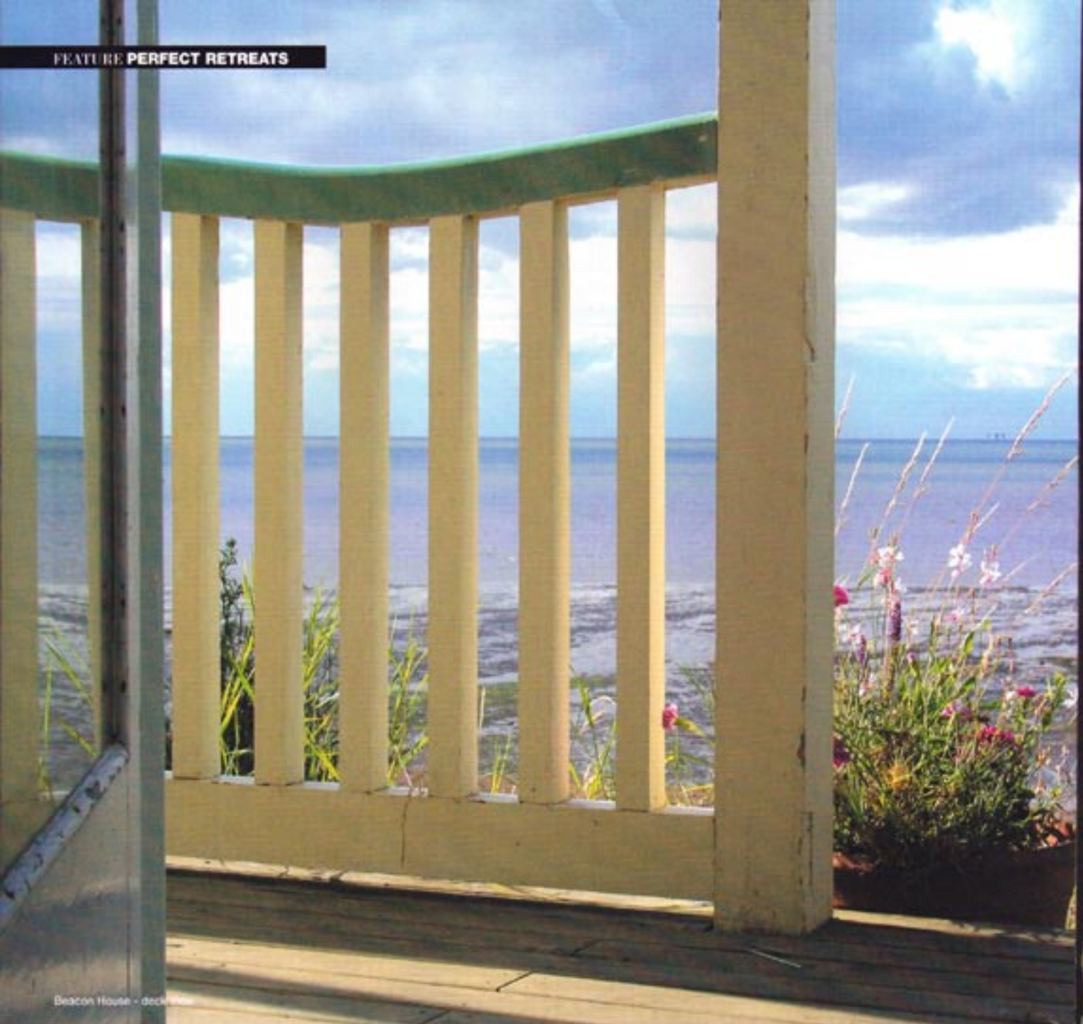
Beacon House - deck view