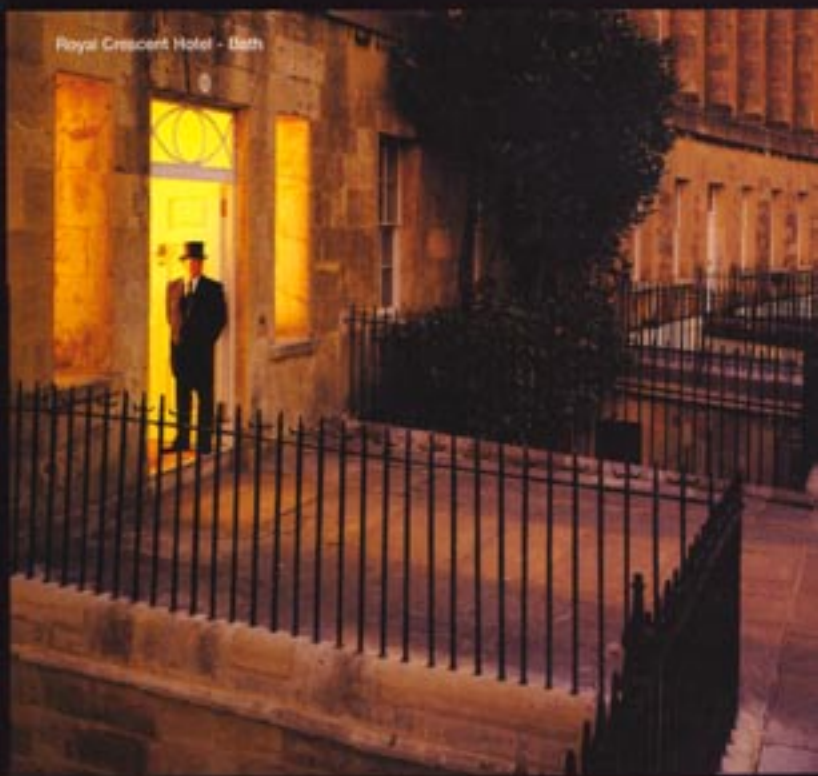
Royal Crescent Hotel - Bath

WITH CHRISTMAS A DISTANT MEMORY AND EASTER STILL A COUPLE OF MONTHS AWAY, THERE'S TIME TO FIT IN A SHORT BREAK - HARRIETTE DEW HAS SOME SUGGESTIONS